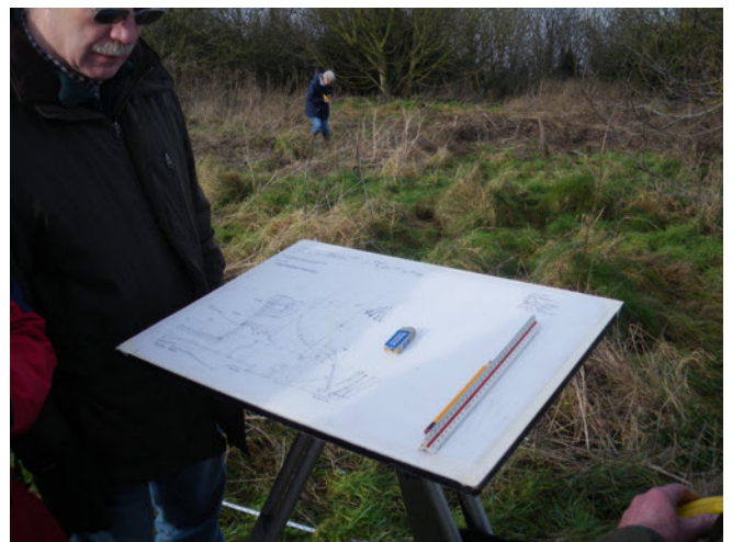
Close up of Earthworks Survey plan