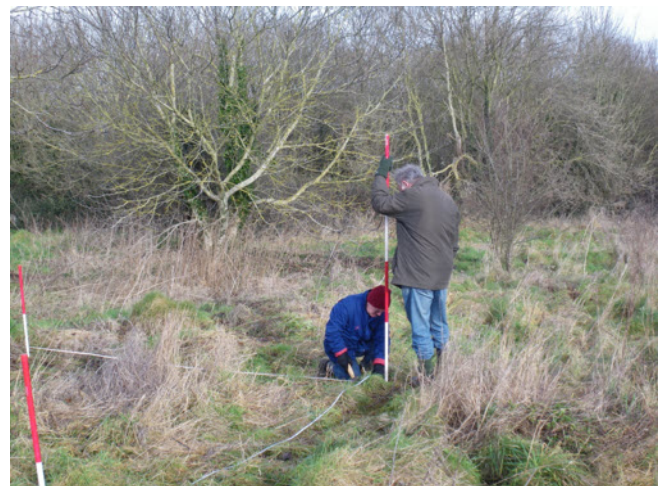
More surveying work